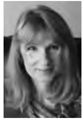
H.E. Klára Novotná

The paintings of the extraordinary artists from a minority Slovak community in Serbia strongly affirm the importance of cultural diversity and multiculturalism, values long cherished by UNESCO. All that has been created and preserved in different domains of human creativity on a territory of one state constitutes its culture. However, the country has the right to be proud of its heritage only if it fosters the diversity of cultural expressions and the balanced multiculturalism. The voices declaring the death of multiculturalism have been uttered by the European political elite. Fortunately, this does not mean that the genuine multiculturalism, based on cultural diversity, has truly disappeared. This is because the multiculturalism is an ideological concept, whereas the multiculturalism, to a lesser or higher degree, is the reality of each society. It has many times been repeated that the beauty will save the world. That will only be possible if each and every flower is blooming and every face smiling, just as on the paintings of Serbia's Slovak artists.